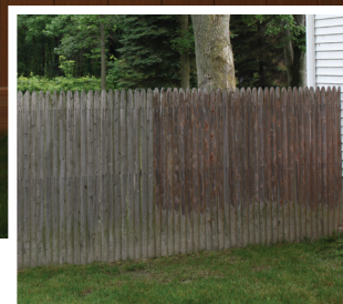
Bufftech vinyl fence outperforms wood fence.

Out of all types of fence materials, wood fences demand the most maintenance and can end up being the most costly. Wood fences must be treated, painted or stained on a regular basis; in fact, the average wood fence owner can expect to spend time and money painting or staining every few years to maintain the fence's appearance and to protect the wood from weathering. Wood that is exposed to the elements will eventually rot over time, resulting in a less stable fence with a shorter life span.