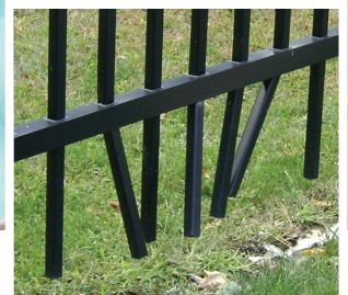
Bufftech vinyl fence outperforms aluminum fence.

Aluminum fences simply aren't as durable as vinyl. Aluminum fences are prone to kinking and bending, particularly when they come into contact with lawn mowers, shrubbery and tree limbs. And while aluminum fences, like vinyl, offer low maintenance, the style and color options for aluminum are very limited. If you're looking for privacy, you're not going to get it with an aluminum fence.